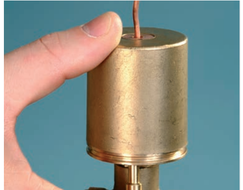
Remote acting fire valve