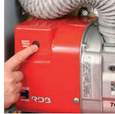
Reset button on floor standing boiler

If the burner fails to operate, check to see if the reset button (lock-out button on the burner) is illuminated. Internal wall hung models have a lock-out lamp on the control panel. If illuminated press the rest button on the burner control box. The reset button should not be pressed more than twice, should a burner lock-out occur. If the burner cannot be reset, first check that you have oil in the tank and also that your fire valve has not tripped. Please refer to page 11. If the problem still exists then contact your installer or service engineer for assistance.