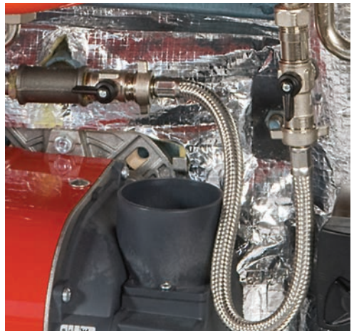
Filling loop fitted in boiler

Your installer should show you how to top up the system using the filling loop, either located in the boiler or on the system pipework. Topping up will be necessary for example when a radiator has been removed for decorating or air is bled from a radiator. Frequent topping up may indicate that there is a leak in the heating system or in one of its components. Contact your installer or service engineer to rectify the problem. Frequent topping up without tracing or rectifying the cause may result in internal damage to the boiler and its components, which would not be covered under the manufacturer's warranty.